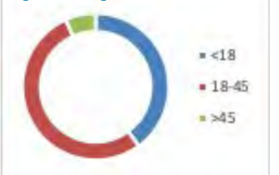
Figure 1: Age of GBV victims

What: Thirty cases involved rape and three attempted rape. This included the rape of children as young as five, rape of a woman aged 70, reoccurring rape of girls by fathers and grandfathers, marital rape and group rape. Many in the sample experienced rape as well as other forms of sexual and physical violence. The sample included the abandonment of a newborn baby, a woman accused and assaulted for alleged witchcraft, and the chaining and deprivation of a woman with intellectual disabilities.